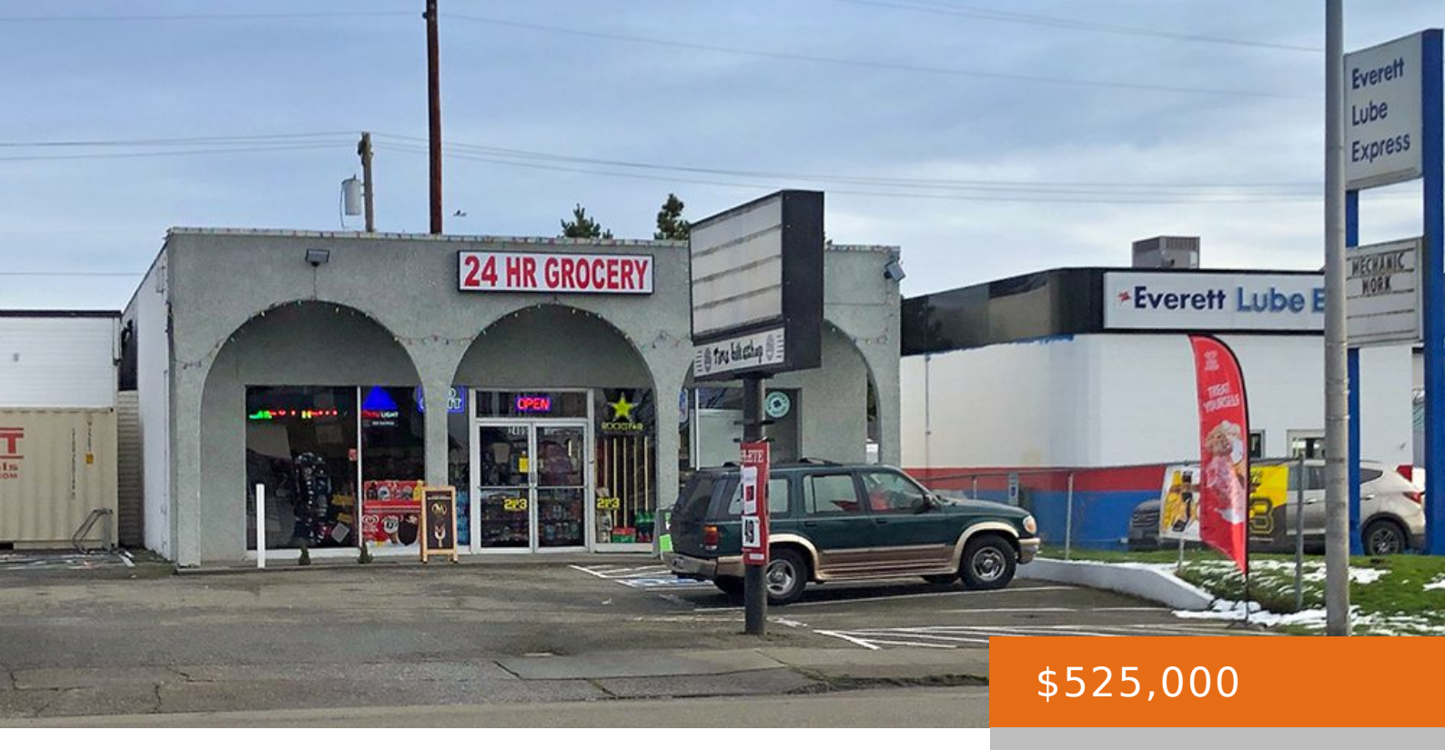
24 HR GROCERY